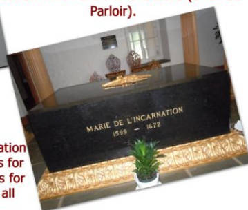
exhibit area, visitors view some personal items, such as her rosary beads, samples of her letters, and a series of paintings depicting her life.

The tomb of Mary of the Incarnation is a prayerful and peaceful oasis for the people living near, as well as for the pilgrims and tourists from all over the world.